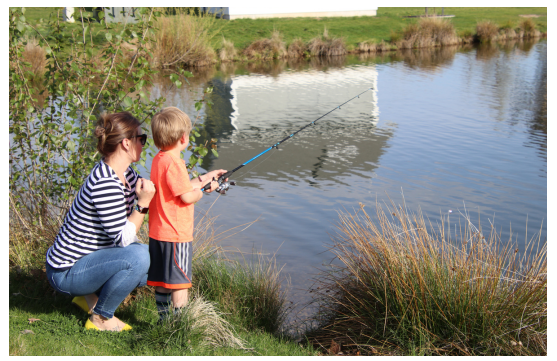
Saturday, May 11-18